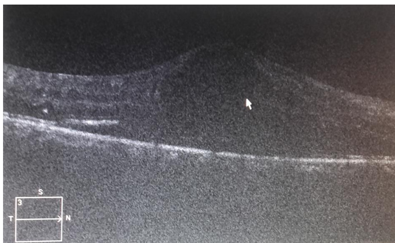
Fig. 2. Optical coherence tomography image of the right eye showing a cystoid macular edema that appeared during treatment of ARN syndrome

Biological results showed normal blood cell counts and normal serum chemistries. Erythrocyte sedimentation rate was 15 mm/h. Human immunodeficiency virus (HIV), HSV 1 and 2, VZV and CMV serologies were negative. The aqueous humor was evaluated for Herpes Simplex Virus (HSV), Varicella Zoster Virus (VZV) and Cytomegalovirus (CMV) by polymerase chain reaction (PCR). The serum VZV PCR was found to be positive while the others were negative. Testing for toxoplasmosis and syphilis were also negative. A prophylactic photocoagulation of the retinal periphery was performed after the first 15 days to prevent retinal detachment.